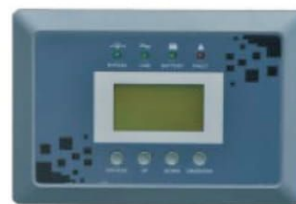
LED+LCD Screen upto 10~60KVA